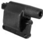
Single Output Epoxy Filled