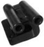
2 Output Side Terminal