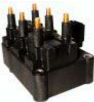
6 Output Top Terminals