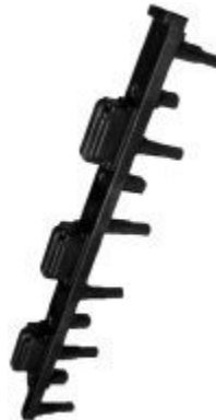
6 Output Bolt-on Cassette Package