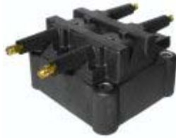
4 Output Side Terminal