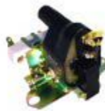
Single Output Epoxy Filled with Ballast Resistor